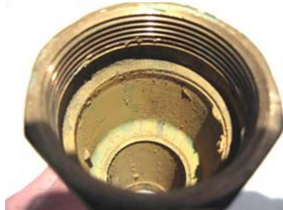
Pipe after 8 weeks with NaturSoft™ System

Attention: Some California, Texas, and Connecticut communities are currently under water softener bans for conventional salt based softeners, and cannot have salt or brine discharge. The NaturSoft™ systems require no backwash, no salt and no brine discharge. NaturSoft™ systems are not affected by those bans.