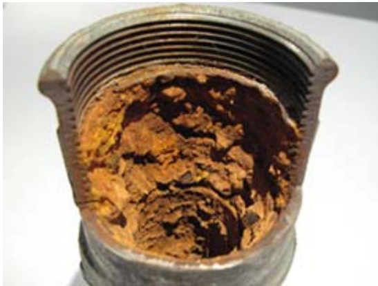
Pipe before NaturSoft™ System